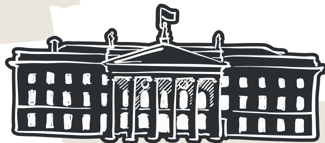
General Post Office (GPO), Dublin

On Easter Monday, the 24th April 1916, a large group of men and women took over key buildings in Dublin city, including landmarks such as Liberty Hall, Dublin Castle and the General Post Office (GPO), which was also the rebels' headquarters.